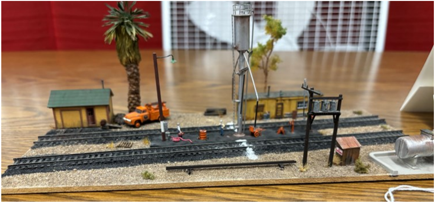
First Place, Merit Evaluated Diesel Facility by Tom Stumpf