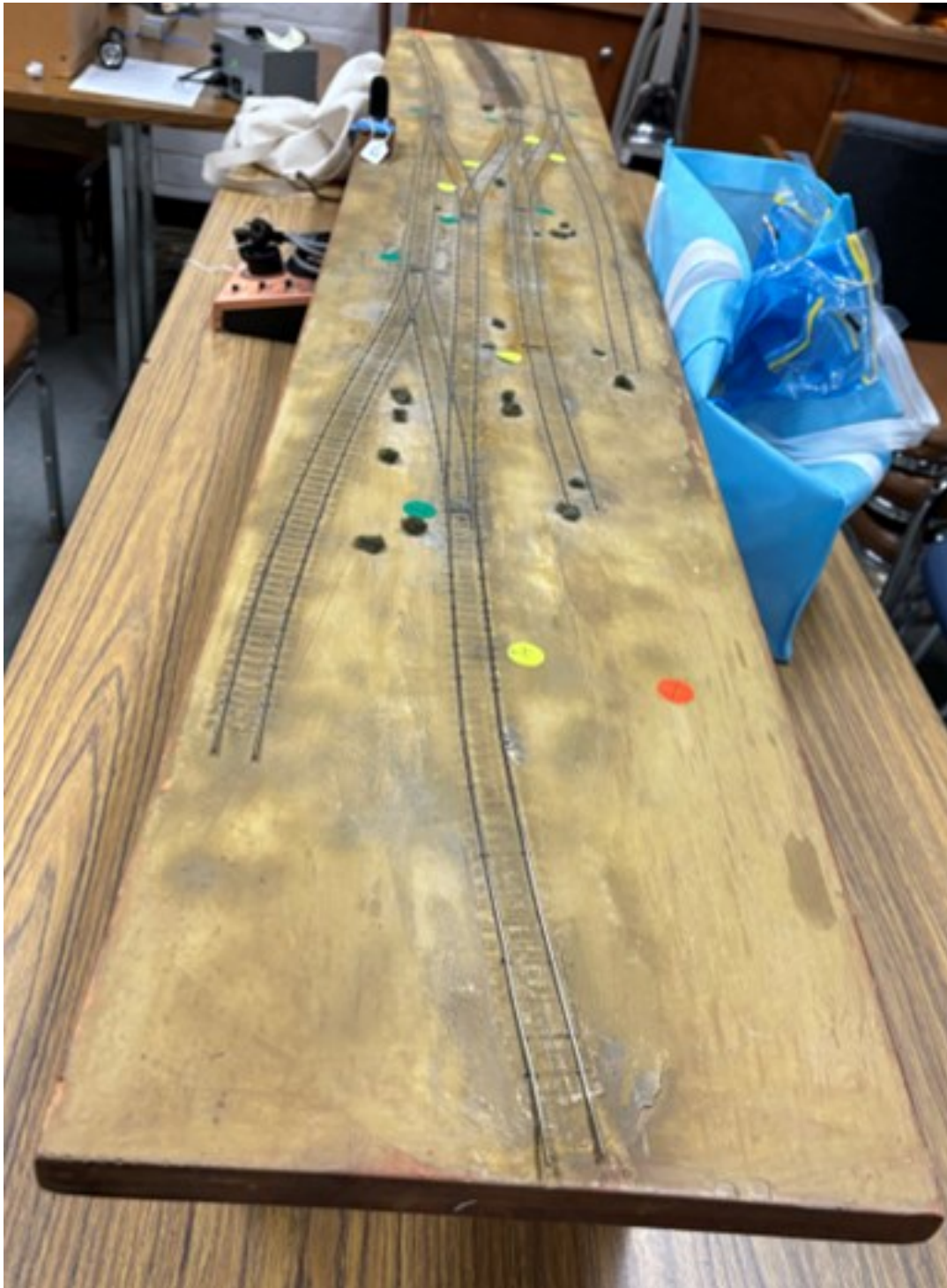
Evaluated towards a Model Railroad Engineer-Civil Certificate Self Switching Layout by Bryan Hunnell