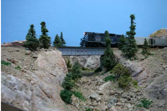
RDA girder Xing the dry gulch