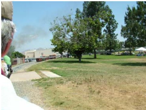
Cajon members enjoying the ride

At 11AM, sharp, the first "All Aboard" call was heard and a large group of members climbed onboard one of the trains; a double-header just for the Cajon members' enjoyment.