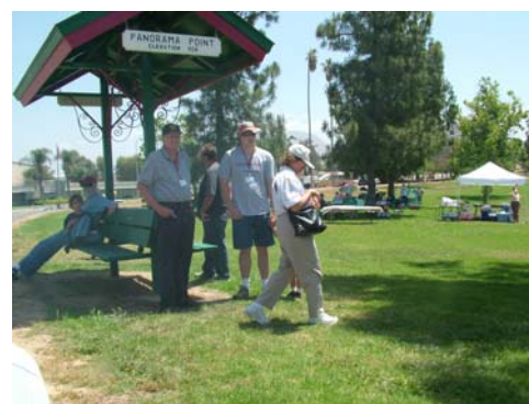
Panorama Point was a popular waiting spot