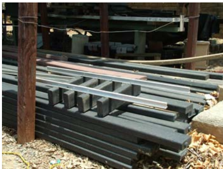
A section of track with plastic ties.

The track was originally built with wooden ties but was changed to plastic ties between 1995 and 2008.