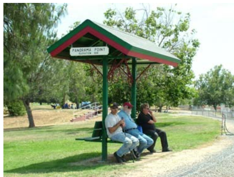
Panorama Point was a popular waiting spot