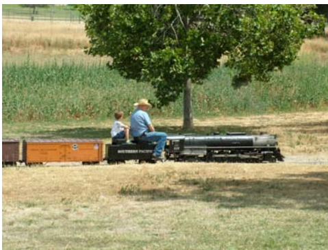
SP Northern #828