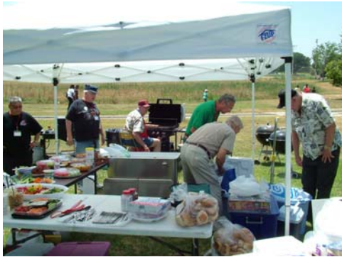
The food area is being prepared

The early birds arrived before 10AM and set up chairs and tables and started the grills.