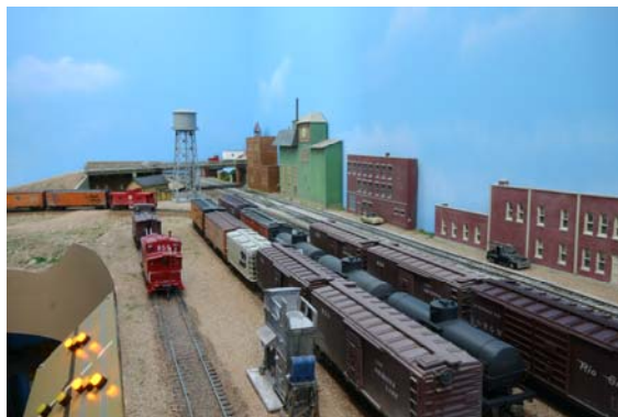
Fully functional yard developed

After the convention was behind all of us, Rick continued having Op Sessions on a