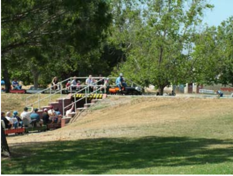
This looks almost like Tehachapi,