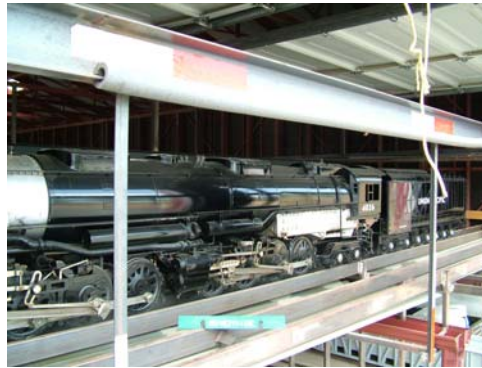
The Big Boy was too big to fit in one picture