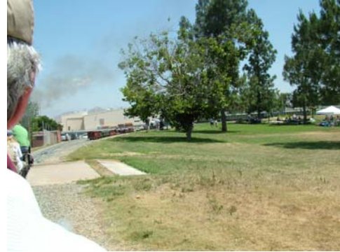
Cajon members enjoying the ride

The ride turned out to be a really long one, one car kept derailing and uncoupling from the rest of the train. It is not just us HO people that seem to have problem with our cars!