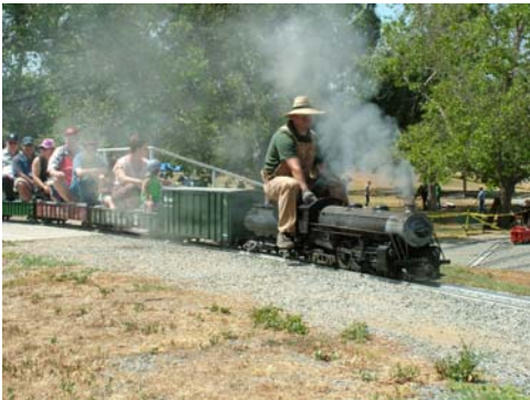
Smoke gets in your eyes