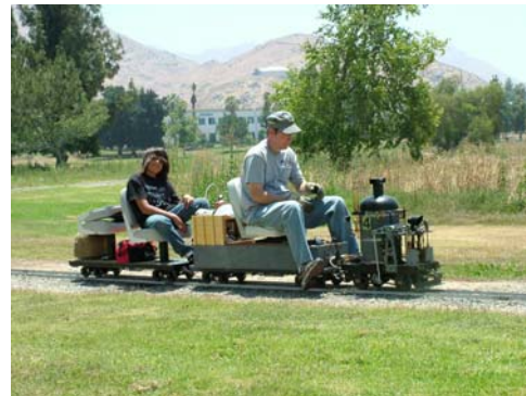
An un-named little engine that could

There were a large number of engines on the track; ranging in size from a vertical boiler little thing to a full grown Santa Fe Northern" 4-8-4 #2926.