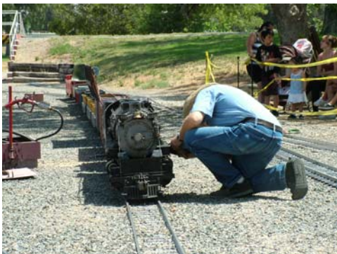
Servicing 828 before the days work begin