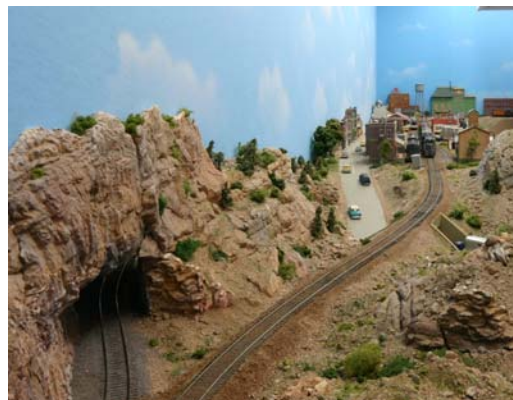
End of Town snuggled away in the hills

regular weekly basis and many of you in Las Vegas finally had a layout to enjoy and run.