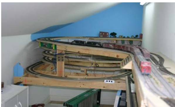
Helix solved a space problem,