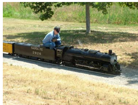
The Santa Fe Northern #2926