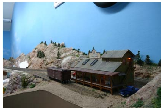
Freight Depot stands ready to load cars