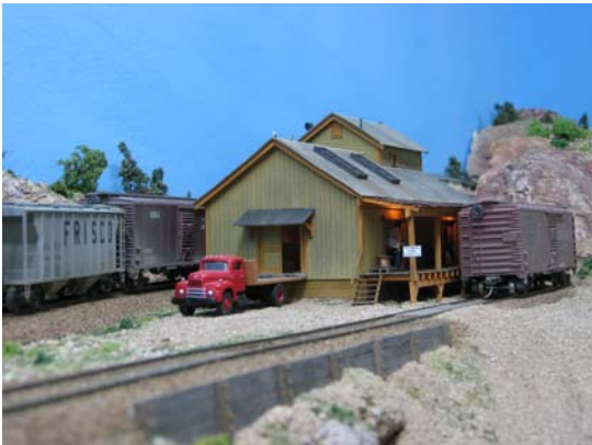
Freight Station awaits loading crew

meets and also started doing clinics, all of which were top notch and always drew a