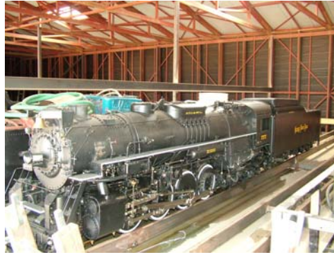
The NKP Berkshire #777 spent the day in the barn