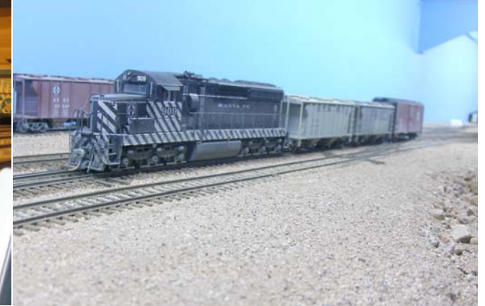
Waiting my turn at Bowling for Trains