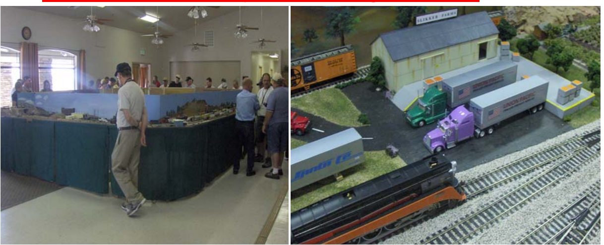
The Pahrump Valley Modular Railroad Club had a very nice layout on display.