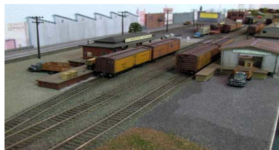
The Layout tours were a big attraction. Darryl Lansing took several pictures for our pleasure