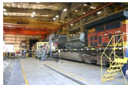
Engine Facility Tour showed the insides of engines under repair