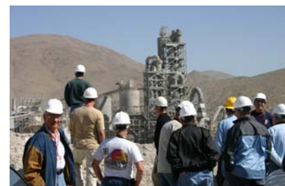
Hard Hats were necessary for the fascinating Cement Plant Tour