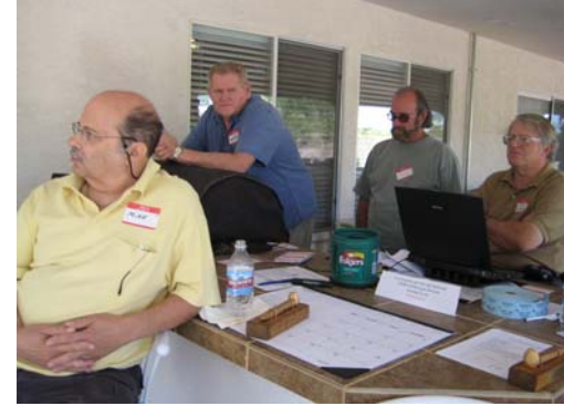
In Photo Left to Right: