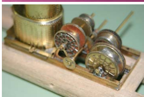
Gears, Wire Reels, and Crankshaft being test fitted. Still a lot of part clean up to do at this point.