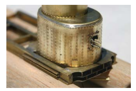
Donkey Photo Update: Boiler in Place with Operating Fire Box Door. Plans are to put a flickering light inside.