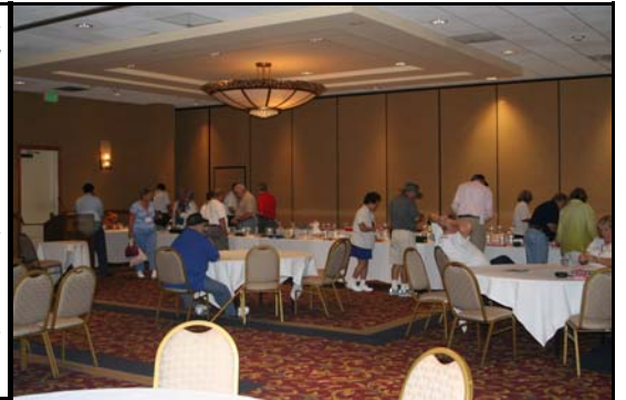
The bidding was fast and furious at the Chinese auction at the PSR Convention. For the first time all the tickets were sold!