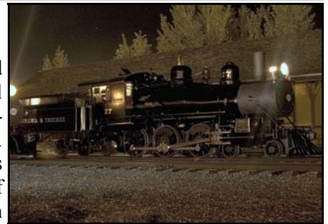
Dave Arendes "Best of Show" photograph "V & T #27."

The contest room was filled with many impressive entries from the talented members of the PSR. Competition was tight and the judges had their hands full of over 40 models entered (a record for a PSR convention). Twenty-eight of these models received merit awards, half of which went to Cajon Division members. Over 40 railroad photographs were entered.