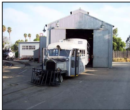
Restored RGS Motor Number 3— one of the famed "Galloping Geese." A Cummins turbo diesel has been installed and the original engine went to Goose 5 in Dolores.