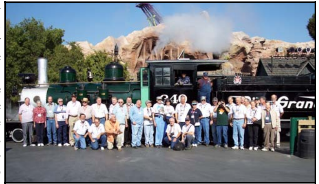
These are the conventioners who attended the Thursday morning Knott's Berry Farm engine house tour. Many stated that this tour was the highlight of the convention!

By Thursday morning some conventioners were already on "track nine" after a thoroughly enjoyable experience with the Knott's Berry Farm railroad gang. The group was given a private tour of the engine maintenance and overhaul facilities. Next came rides on the park's two trains powered by ex-Rio Grande Southern No. 41 and ex-Denver & Rio Grande Western No. 340. Runbys were performed for the group by each locomotive singularly and double-headed. You could see the pride in the faces of the train crews as they went about their work. Attendees were also given several rides around the park in the restored ex-RGS "Galloping Goose" No. 3.