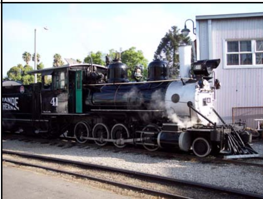
Former Rio Grande Southern C-19 Number 41, restored to her glory days and converted to burn propane.